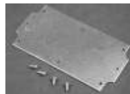
26-1555 Series Recessed lid for membrane keypad & PCB spacers moulded into lid - designed for #6 self-tapping screws.