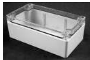
26-1554 '2' Series Flat opaque lid and clear lid option