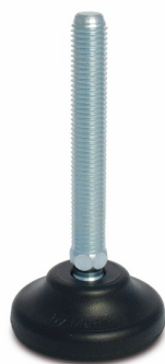
Two piece part