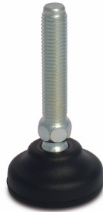
Two piece part